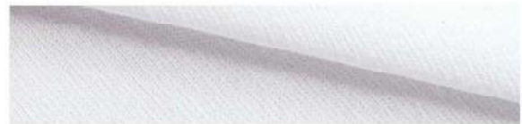
Quality: 100% Cotton French Terry Trend Name: Bianca Blend: 100% Cotton Weight: 240 GSM Width: 36"