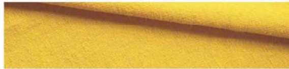
Quality: Cotton Lycra Single Jersey Trend Name: Neve Blend: 95% Cotton 5% Lycra Weight: 200 GSM Width: 36"