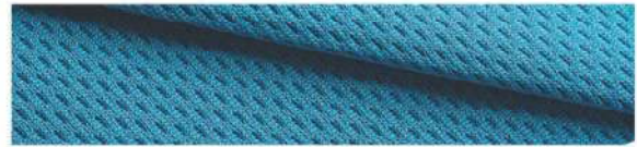
Quality: 100% Polyester Mesh Trend Name: Giada Blend: 100% Polyester Weight: 150 GSM Width: 72"