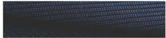
Quality: 100% Polyester Polycard BSB Trend Name: Liso Blend: 100% Polyester Weight: 300 GSM Width: 72"