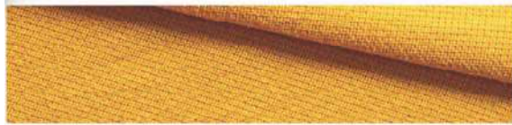
Quality: Cotton Lycra Pique Fabric Trend Name: Noel Blend: 95% Cotton 5% Lycra Weight: 200 GSM Width: 36"