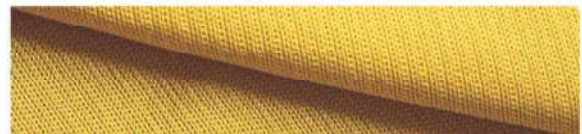
Quality: Super Poly (Inner Brushed) Trend Name: Gale Blend: 100% Polyester Weight: 280 GSM Width: 72"