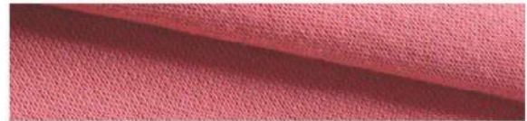
Quality: PC Fleece Inside Brushed Fabric Trend Name: DE Rays Blend: 70% Polyester 30% Cotton Weight: 330 GSM Width: 68"