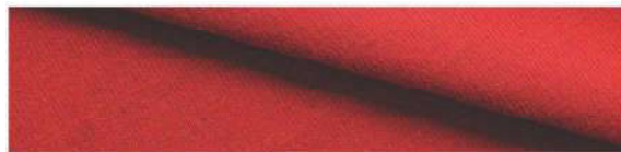
Quality: PC Single Jersey Trend Name: Capri Blend: 50% Polyester 50% Cotton Weight: 240 GSM Width: 36"