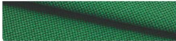
Quality: PC Pique Fabric Trend Name: Melissa Blend: 65% Cotton 35% Polyester Weight: 240 GSM Width: 36"