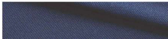
Quality: 100% Polyester Interlock Trend Name: Delaine Blend: 100% Polyester Weight: 140 GSM Width: 72"